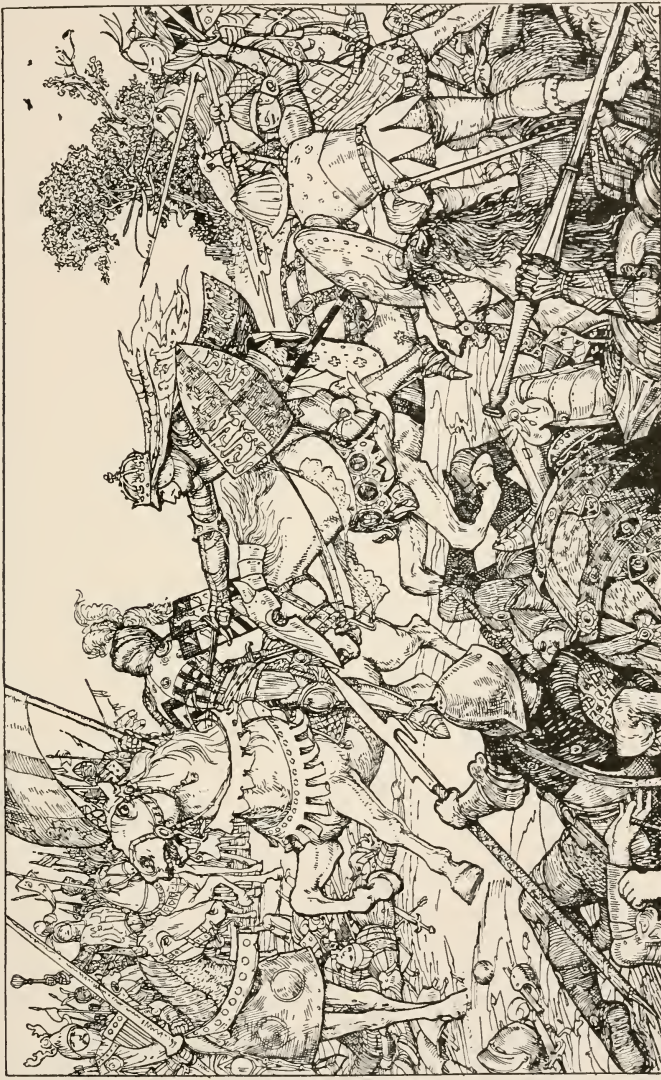
RICHARD'S LAST CHARGE ON BOSWORTH FIELD